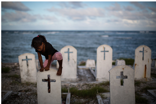
Eroding seaside cemetery, Marshall Islands.