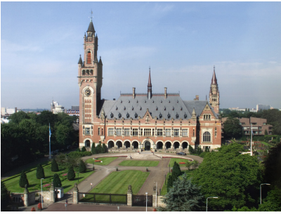
International Court of Justice in The Hague

for the abolition of nuclear weapons with its cases in the International Court of Justice (ICJ) claiming breach of the obligation to negotiate nuclear disarmament. The Marshall Islands' determination grows out of its experience with nuclear detonations, documented by this excellent Washington Post story by Dan Zak, " A Ground Zero Forgotten ".